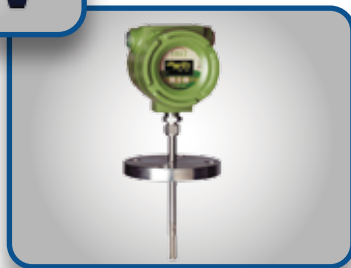
SAGE RIO ™